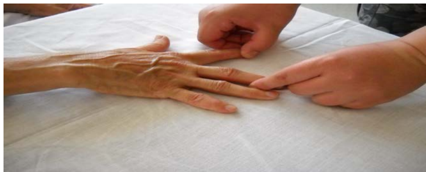
Fig.2 Finger abduction and adduction with the kinetotherapist resistance