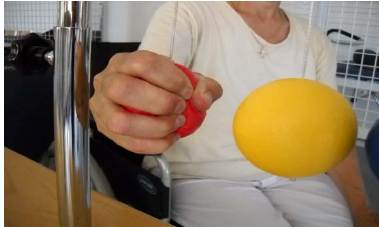
Fig.1 Ball catching and pulling them to heel