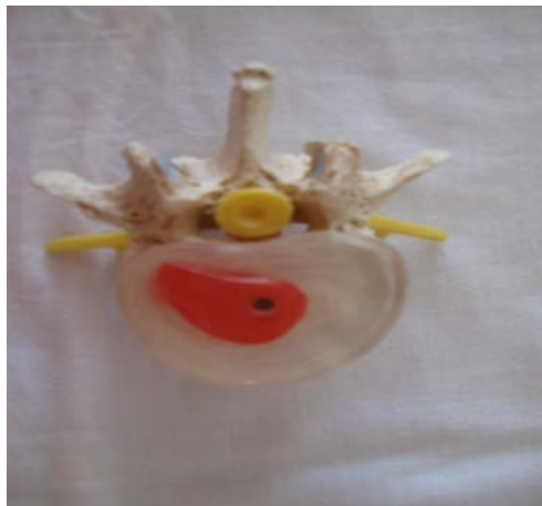
Fig.1 Disc protrusion

Disc protrusion is a pathological process located at the level of the intervertebral disc and is characterized by a partial rupture of the layers of fibrous ring which has the effect the protrusion of the nucleus in the area of the rupture. This is accompanied by increasing volume of the intervertebral disc in the area where the nucleus exerts pressure.